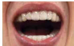
Wear tray 15 – 60 minutes