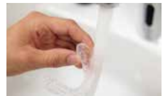
Clean tray and teeth

VOCO GmbH Anton-Flettner-Straße 1-3 27472 Cuxhaven Germany