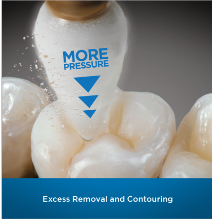
Excess Removal and Contouring