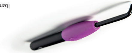
Item no. 3000-KL

«K-Lite is the Key that makes visible your invisible esthetic work»