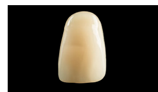
Charisma – Old