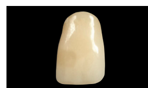
Gaenial Anterior (GC)