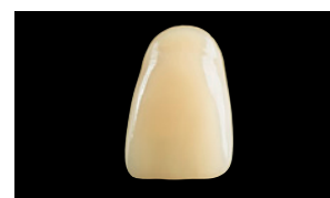
Charisma – New

The secret behind the intensely natural look: Charisma's ideal shade match makes single-shade layering techniques even more easy and convenient