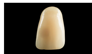
Z100 (3M Espe)