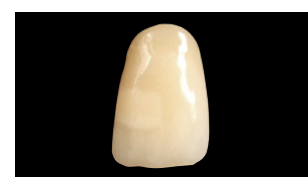
Amelogen Plus (Ultradent)