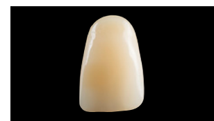
Herculite XRV Ultra (Kerr)